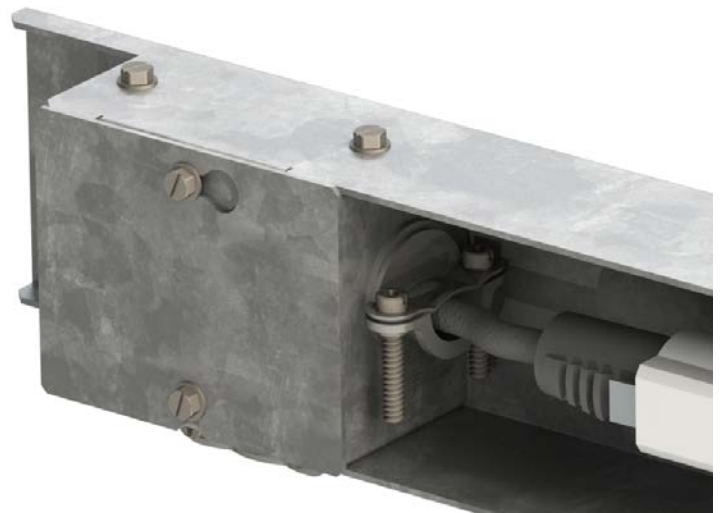
Integrated Wiring Box & Quick Disconnect

Engineered and manufactured in New York and Buy America compliant, G&G's TRX fixture is built on quality, innovation, and the latest in LED technology.