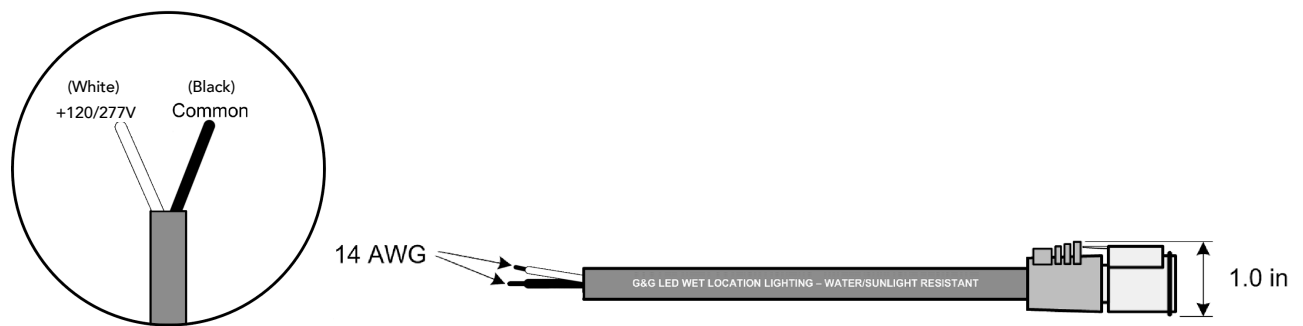
Figure 6.1 and 6.2: Leader Cable Dimensions and Wiring