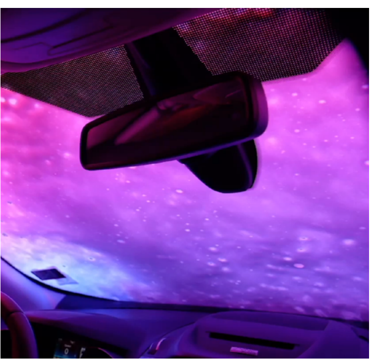
Rev Date 20 0427